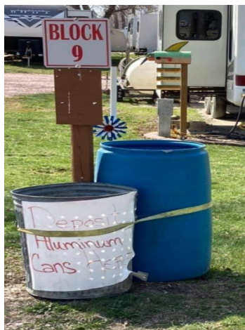
Donate those used cans to Woodland Park